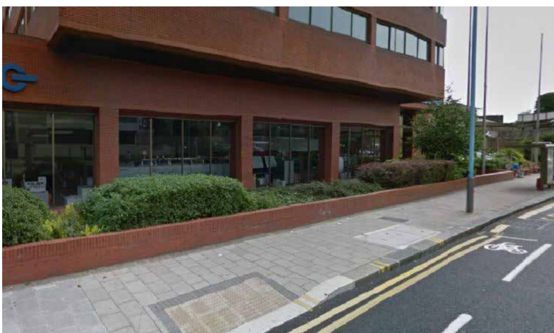
Current view from the High Street

We are also significantly increasing the amount of public realm on the high street, widening the pavement from under 2 meters in places currently to between 5.7 and 7.2 meters with the new proposals.