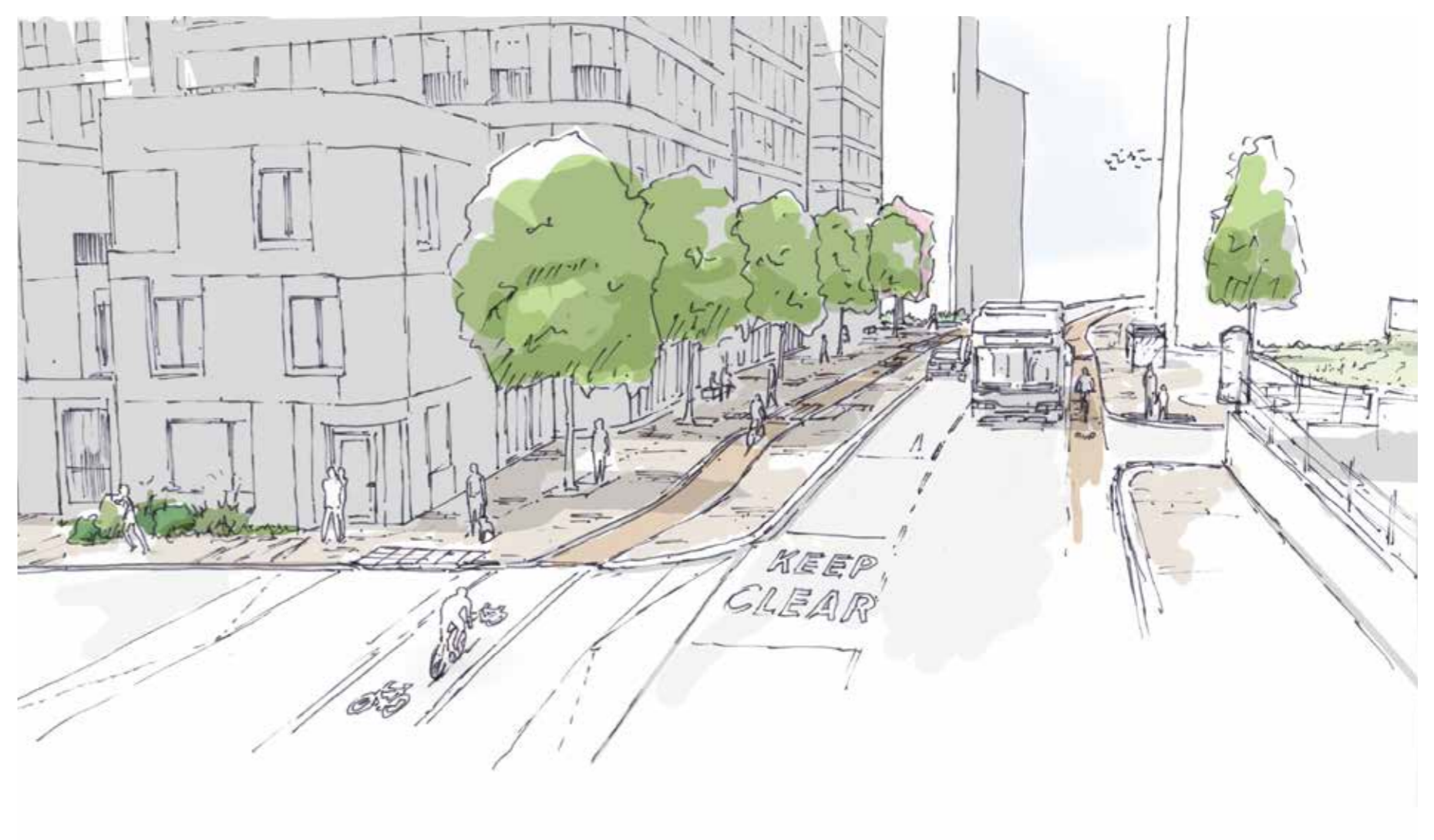
Proposed view from the High Street